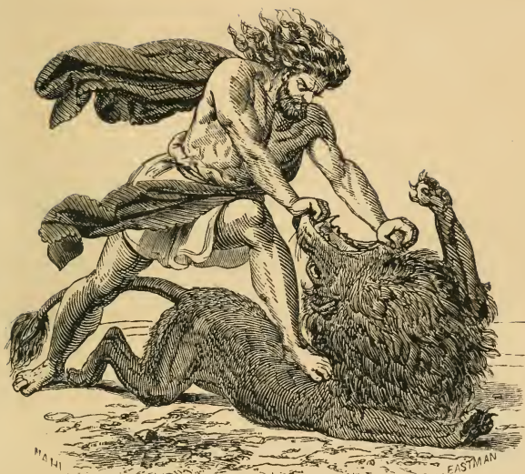
SAMSON KILLING THE LION.

“ Who tore the lion, as the lion tears the kid.” Page 168.